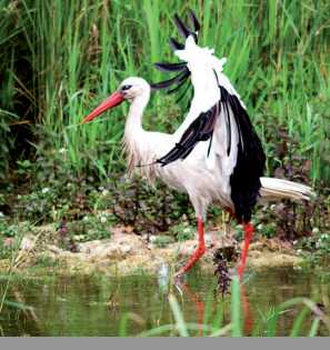
WHITE STORK conia ciconia)

These small highland cattle have become very emblematic and have been introduced into certain protected areas of the Marais Vernier for environmental management purposes on the wettest parts. Very well adapted to the particularities of these environments, the use of highlands in extensive grazing allows the maintenance of open environments, favorable to the expression of an important and patrimonial biodiversity.