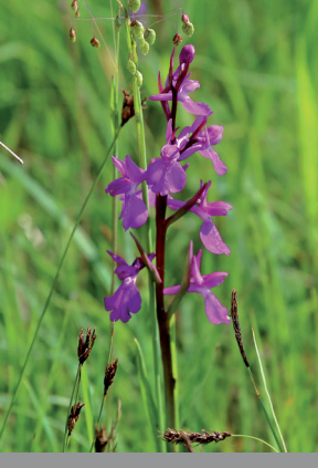
RSH LAX-FLOWERED ORCHID (Anacamptis palustris)

Highly dependent on wetlands for their food and especially that of their young, storks have become emblematic and help to raise public awareness of the issues of preservation of these environments.