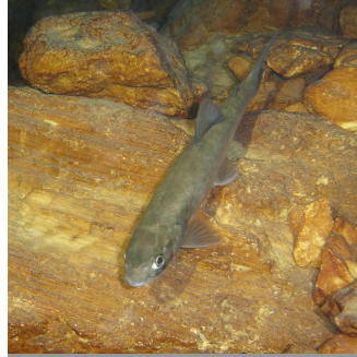
ARCTIC CHAR ( Salvelinus alpinus )

Since 2000, a reintroduction program has included the creation and restoration of aquatic and dry environments, as well as small wildlife crossings.