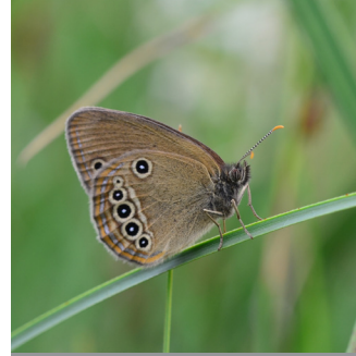
FALSE RINGLET ( Coenonympha oedippus )

The ban on its consumption, which has been in place for several years, does not compensate for the species' natural spawning deficit.