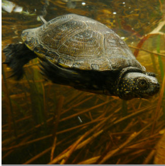
EUROPEAN POND TERRAPIN ( Emys orbicularis )

Amphibious reptile, the European pond terrapin lives in calm and well vegetated waters and lays its eggs in the dry grasslands around the lake.