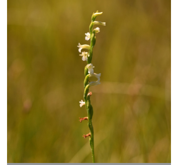
SUMMER LADY'S-TRESSES ( Spiranthes aestivalis )

This population is however threatened, not by the absence of the host plants of its caterpillar (mullein and other grasses, sedges, etc.), but by the drying up of the marsh which leads to a decrease of the humidity and the availability of nectariferous flowers; two factors which are essential for the adults.